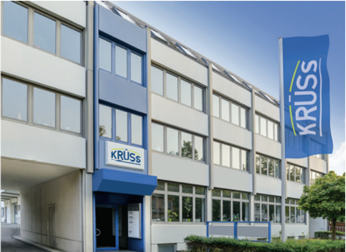
A.KRÜSS Optronic Headquarters in Hamburg

A.KRÜSS Optronic is a leading manufacturer of high-precision laboratory and analysis instruments. For more than 200 years we have been developing and manufacturing innovative product solutions for the quality control of raw materials, semi-finished products and end products in Germany.