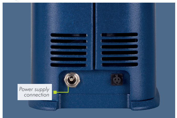
Power supply connection