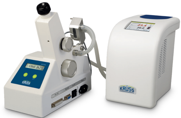
AR2008 with circulation thermostat PT80

The PT80 and PT31 circulation thermostats are often used for the sample temperature control of refractometers, whereby the temperature control of Abbe refractometers is particularly popular. Abbe refractometers can therefore achieve highly accurate and extremely reproducible measurement results completely independent of the ambient temperatures. The more powerful PT80 guarantees fast and stable temperature control of the measurement sample even in laboratories without air-conditioning. Both circulation thermostats are extremely small and can be very easily connected to all water-temperable refractometers.