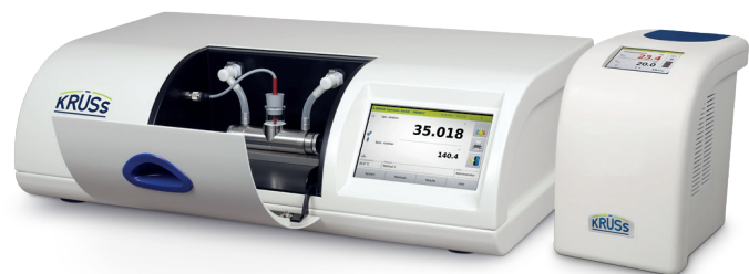
P8000-T with circulation thermostat PT80

When used in combination with polarimeters, the PT80 or PT31 circulation thermostats ensure uniform temperature control of the samples to be measured. This enables high-precision and reproducible measurements, such as those prescribed by different standards in the pharmaceutical industry at 20 °C or 25 °C. Water-temperable measuring tubes from all manufacturers can be temperature-controlled with our circulation thermostats and are connected in no time at all using the quick couplings for hoses integrated in our polarimeters.