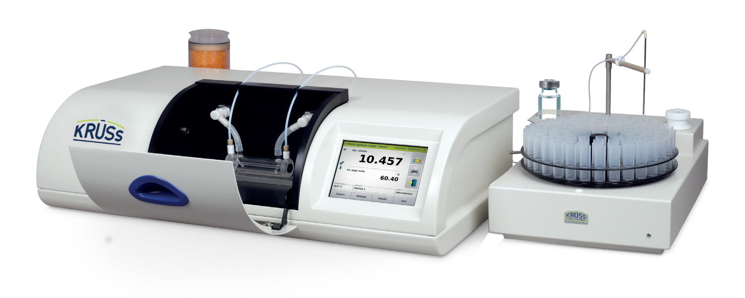
Fully automatic sample supply with P8000-TF, peristaltic pump DS7070 and autosampler AS90