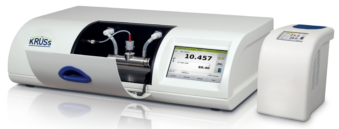
P8000-T80 with measurement tube PRG-100-ET, temperature probe PRT-T and circulating thermostat PT80