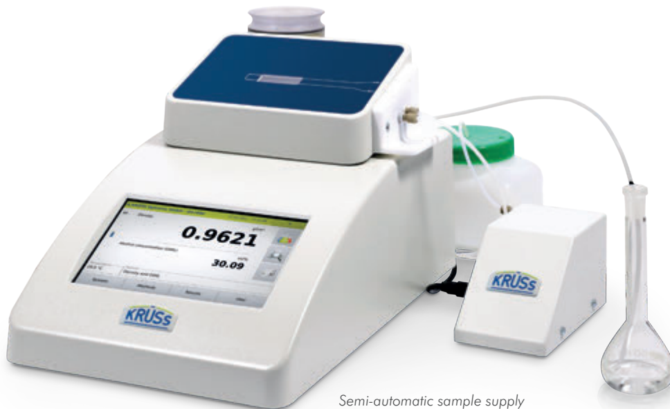
Semi-automatic sample supply with DS7800 via peristaltic pump DS7070