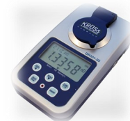
DR6000-T or 6200-T Digital Refractometers