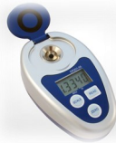
DR201-95 and DR301-95 Digital Handheld Refractometers