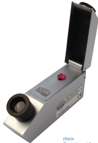
ER604 Illumination not figured