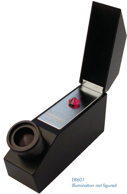
ER601 Illumination not figured

Gemstone refractometers are used for the classification and quality control of gemstones. The gemstone to be examined is simply placed on the prism with a drop of contact fluid. The refractive index of the gemstone is read through the ocular of the refractometer. The refractive index is an important parameter in classifying a mineral or gemstone. Each mineral has its typical refractive index, due to its chemical composition and crystalline structure. Our gemstone refractometers are characterised by their particularly sharp image and good readability. With the sodium filter that only lets through light with a wavelength of 589 nm, the refractometer can be used as a mobile unit with an ordinary light source or with sufficient ambient lighting. LED illumination is also available with a wavelength of 589 nm.