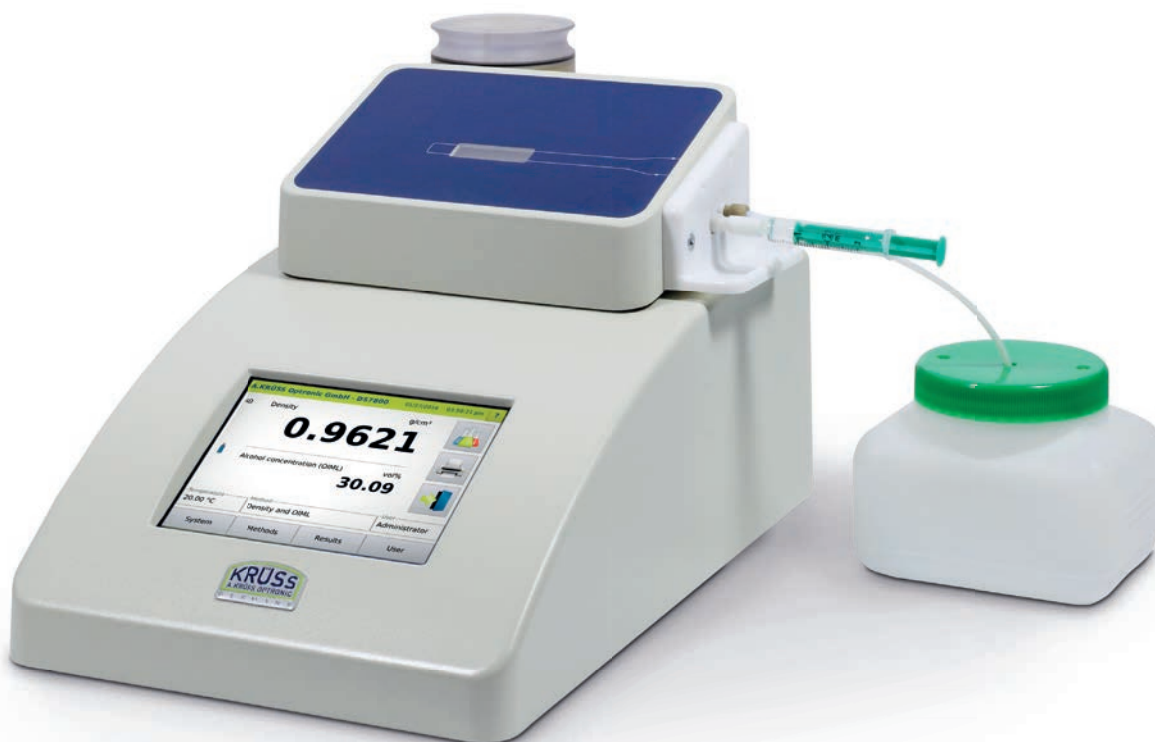
Manual sample supply via syringe