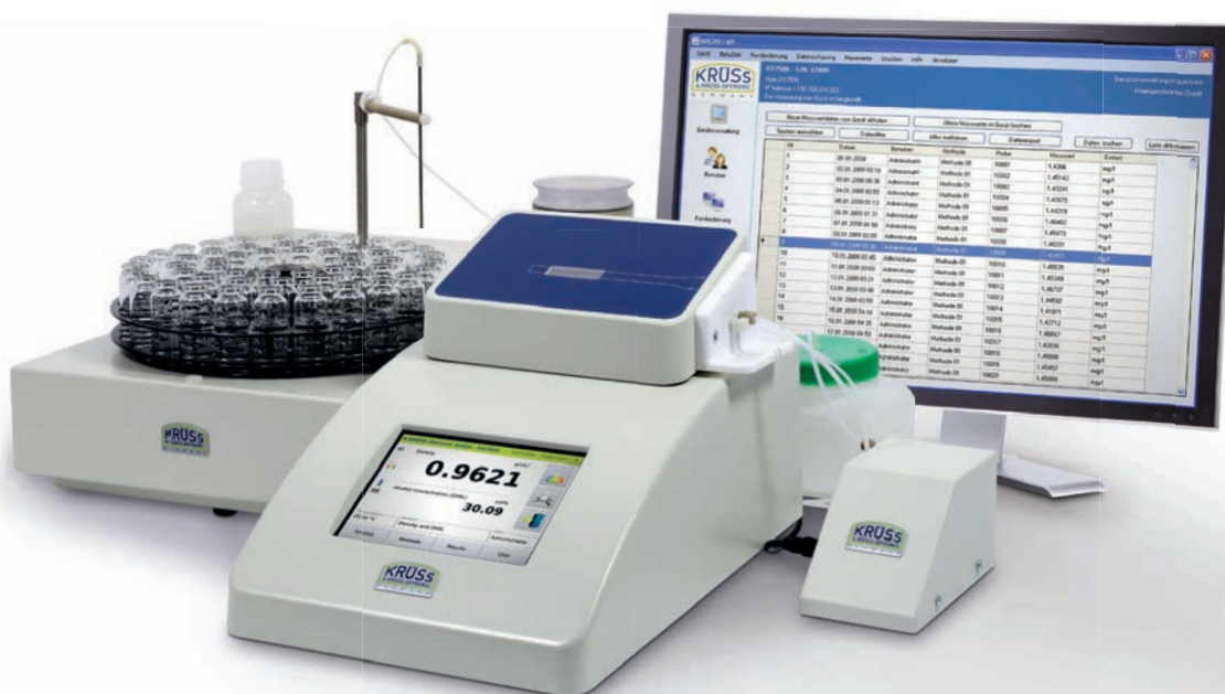
Fully automatic sample supply via autosampler AS90