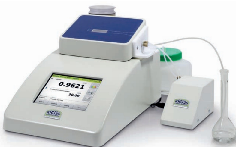
Semi-automatic sample supply via peristaltic pump DS7070

Together with the peristaltic pump DS7070, the AS80 and AS90 autosamplers allow for a fully automatic process. The samples on the autosampler's rotating plate are removed successively by the suction needle and drawn into the U-tube oscillator by the peristaltic pump. If desired, the system can be automatically rinsed and dried after each measurement.